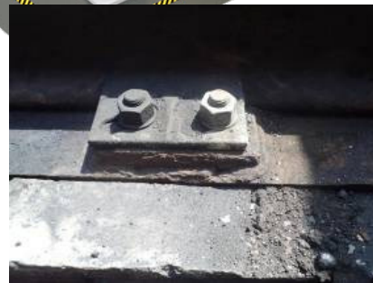
Rail clamp welds starting to corrode.