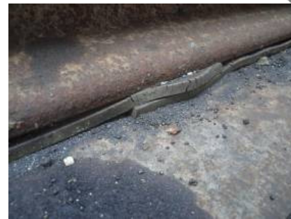
Rail pad not properly installed.