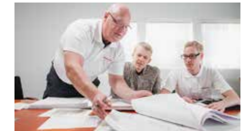
Recommendations with on-site consultation.