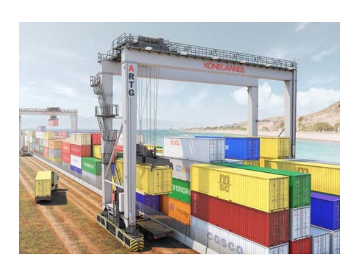
Konecranes' new ARTG version 2.0 cranes enhance safety and uptime.