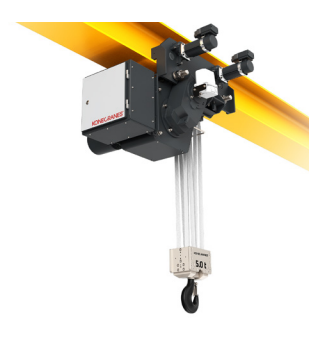
The normal headroom trolley is an ideal solution when every centimeter of lifting height is critical.