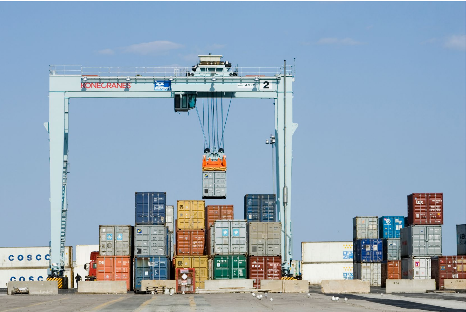
Massport upgraded 5 Konecranes RTG cranes with the latest Konecranes RTG technology

Konecranes USA successfully retrofitted its RTG cranes at the Port of Boston with the latest Konecranes RTG technology, including both Drive and Control System and Smart Feature retrofits.