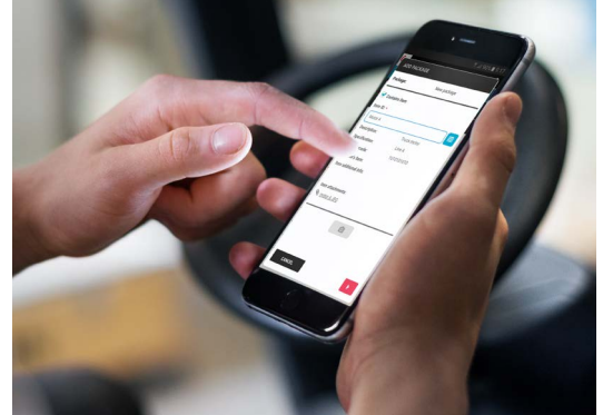
Agilon Mobile can also be used as a stand-alone solution for managing warehouse transactions and materials.