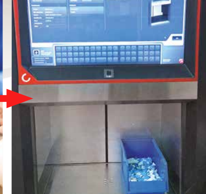
If necessary, retrieve packages from Agilon to check the item balance.