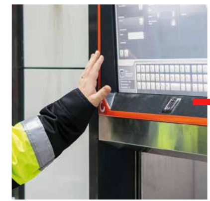
Incoming items are received directly by Agilon and data transferred to the enterprise resource planning system.