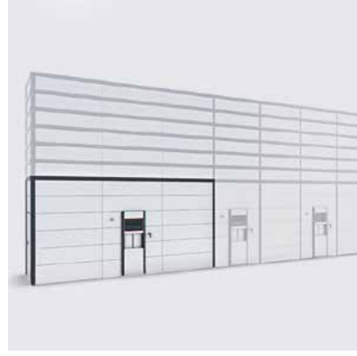
The Agilon system can be expanded when your operations change.