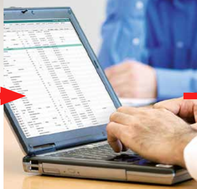
The system stores the transaction and allows full monitoring of inventory levels.