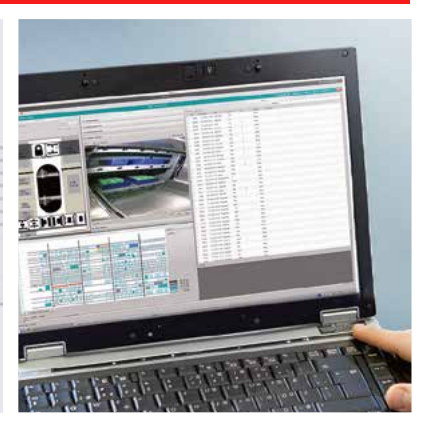
Remote monitoring ensures that your service functions correctly.