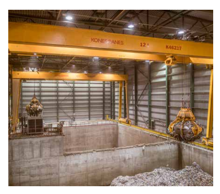
Konecranes fully automated 12 ton waste-to-energy cranes at Riikinvoima plant in Finland.